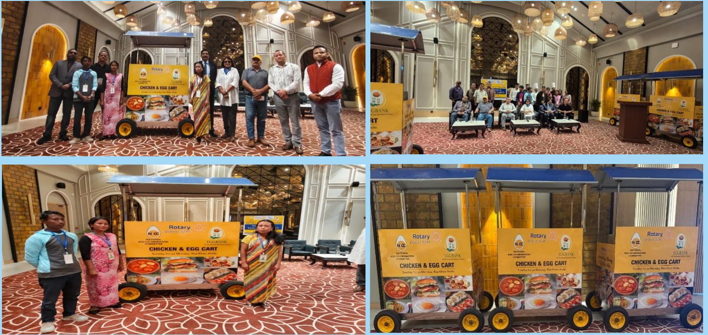
Handing Over of Egg Push Carts to the beneficiaries in Sohra , East Khasi Hills, Meghalaya by Rotary Club of Shillong.